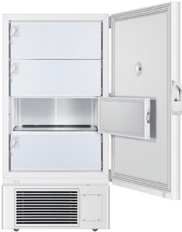
NU-99728 Ultralow Temperature Freezer