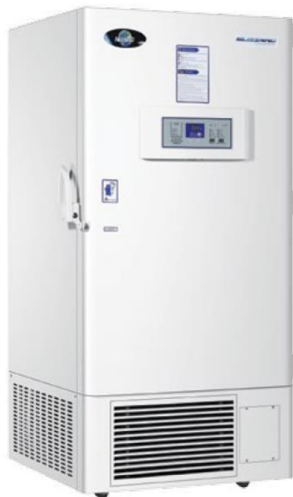
NU-99728 Ultralow Temperature Freezer